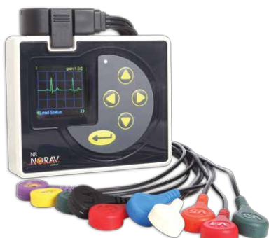
Holter ECG Recorder